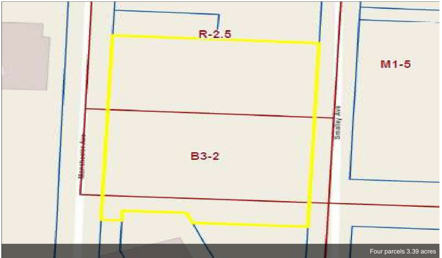
Four parcels 3.39 acres